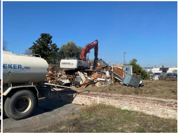
Maple Ave. House Demo- Raymond demolished the house, metal building, and trees located behind the Kroeker Inc. yard. Jobs is almost complete pending final inspection and a well demo.